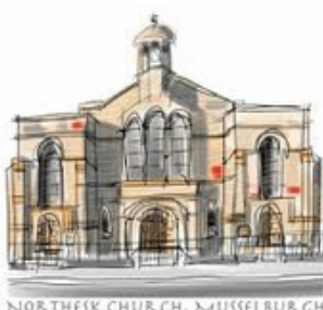
NORTHESK CHURCH, MUSSELBURGH